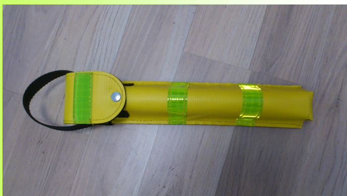
Convenient carry pouch, highly visible, leather padded, hanging loop and belt clip.