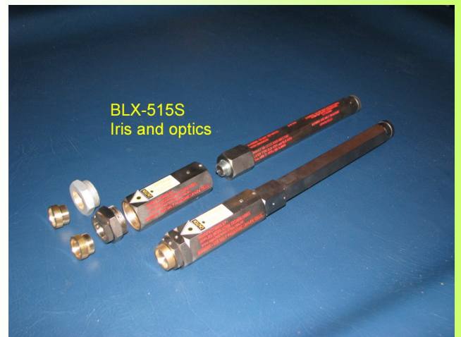
BLX-515S Iris and optics

Adjustable IRIS system to aperture the beam down to 1mm for close-up, precise alignment.